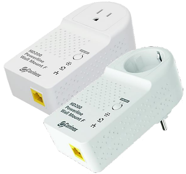
Figure 1: N. America (top) and EU (bottom) versions

The HD200 Wall Mount F Adaptor incorporates the latest Powerline Communication technologies and standards to seamlessly integrate and synergize with your existing office network appliances. And with the built-in three-prong female power adaptor, there's no need to sacrifice a perfectly usable outlet for installation.